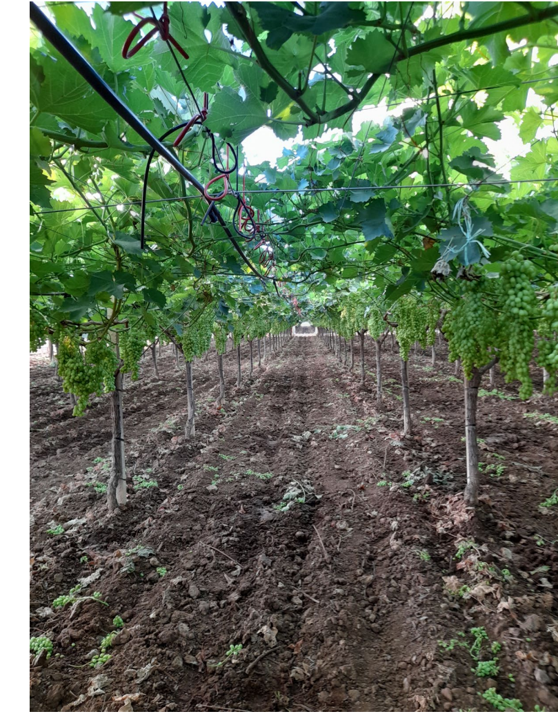
Vineyard, Farm 9

Stakeholders: CIO pomodoro (Tomato Inter-regional horticultural and fruit production Consortium), Coldiretti, FederBio