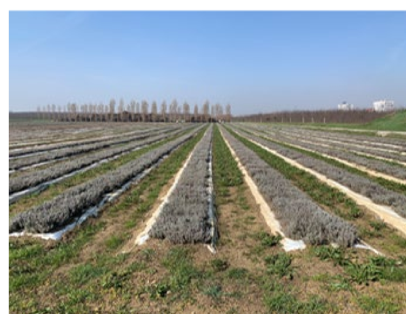
Officinal herbs, Farm 6