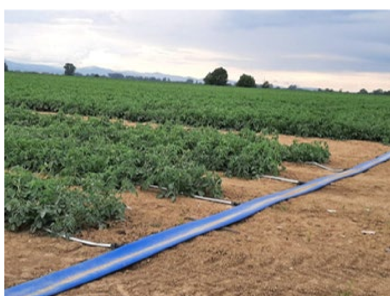
Industrial tomato field , Farm 3

Management: Conv conventional ; Org: organic ; Trans: transition from conventional to organic Cropping system categories: C: Cereals dominated ; V:Vegetables dominated ; W: Woody plants