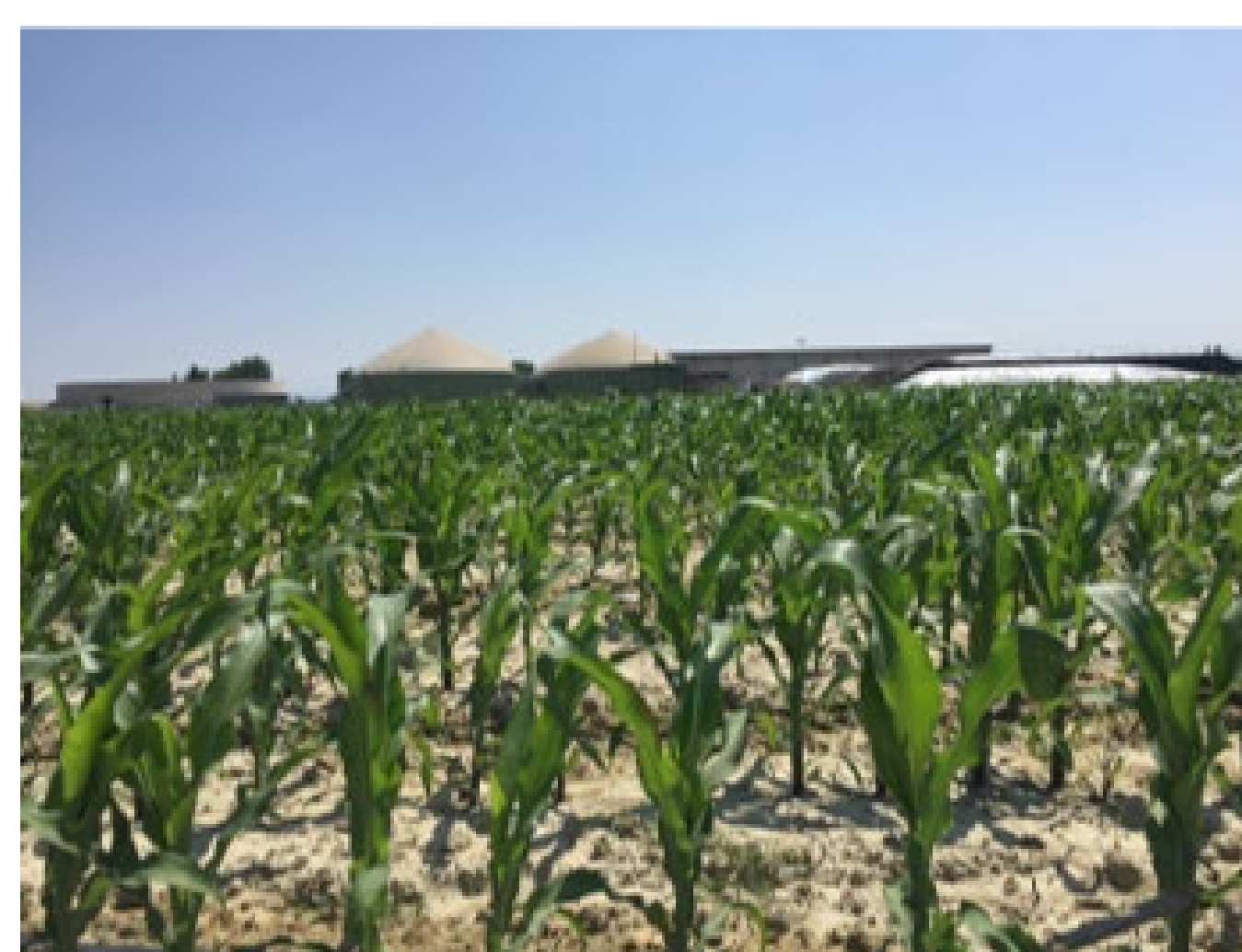
Silage maize in biogas, Farm 2